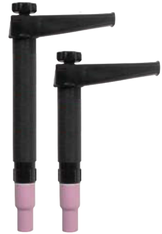
Part No. AQ-27B